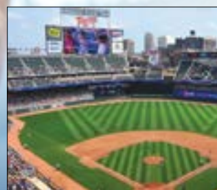
Join our CEO at Twins Game